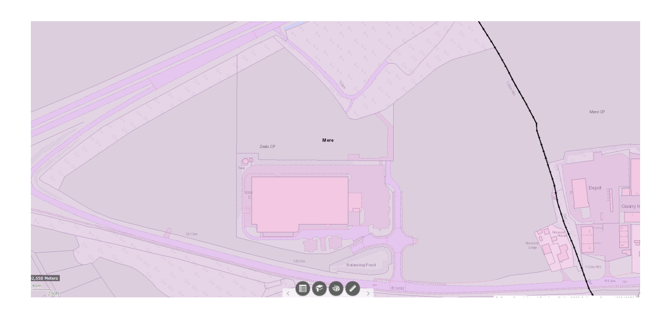
Norwood Lodge & Norwood House